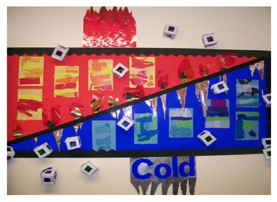
Collages created from pieces of scrap paper – tissue, magazines, cellophane etc – to build up a colour palette.