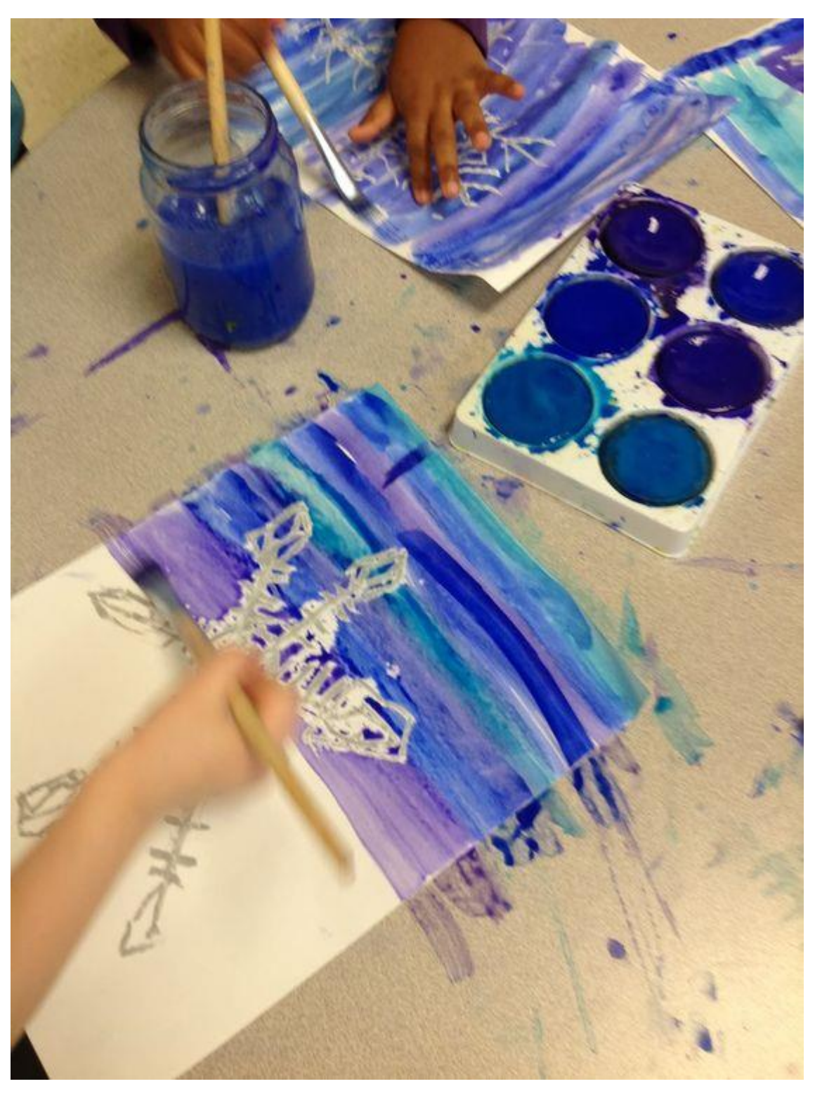
Use white crayon on paper to draw a snowflake and then use a watery blue paint to create a 'wash' over the top.