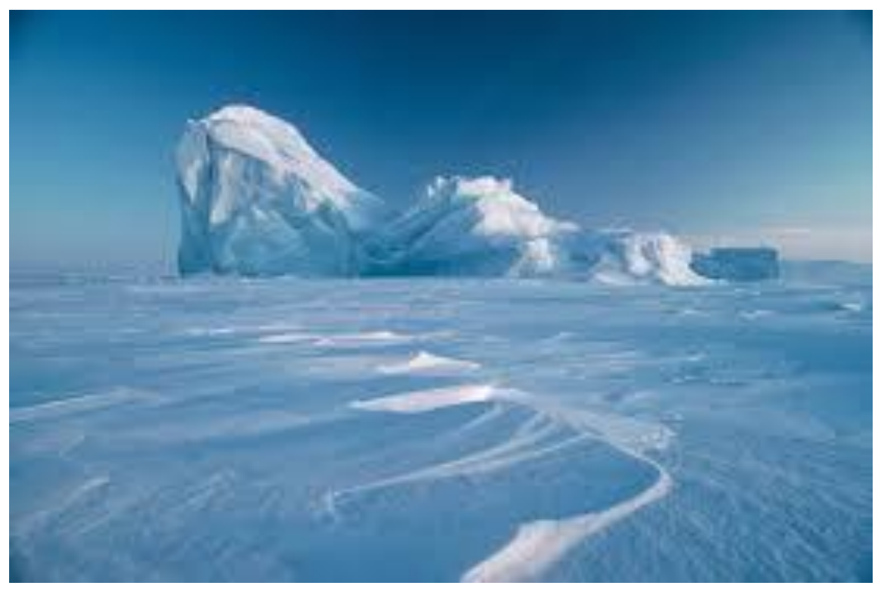
Hot and cold colours