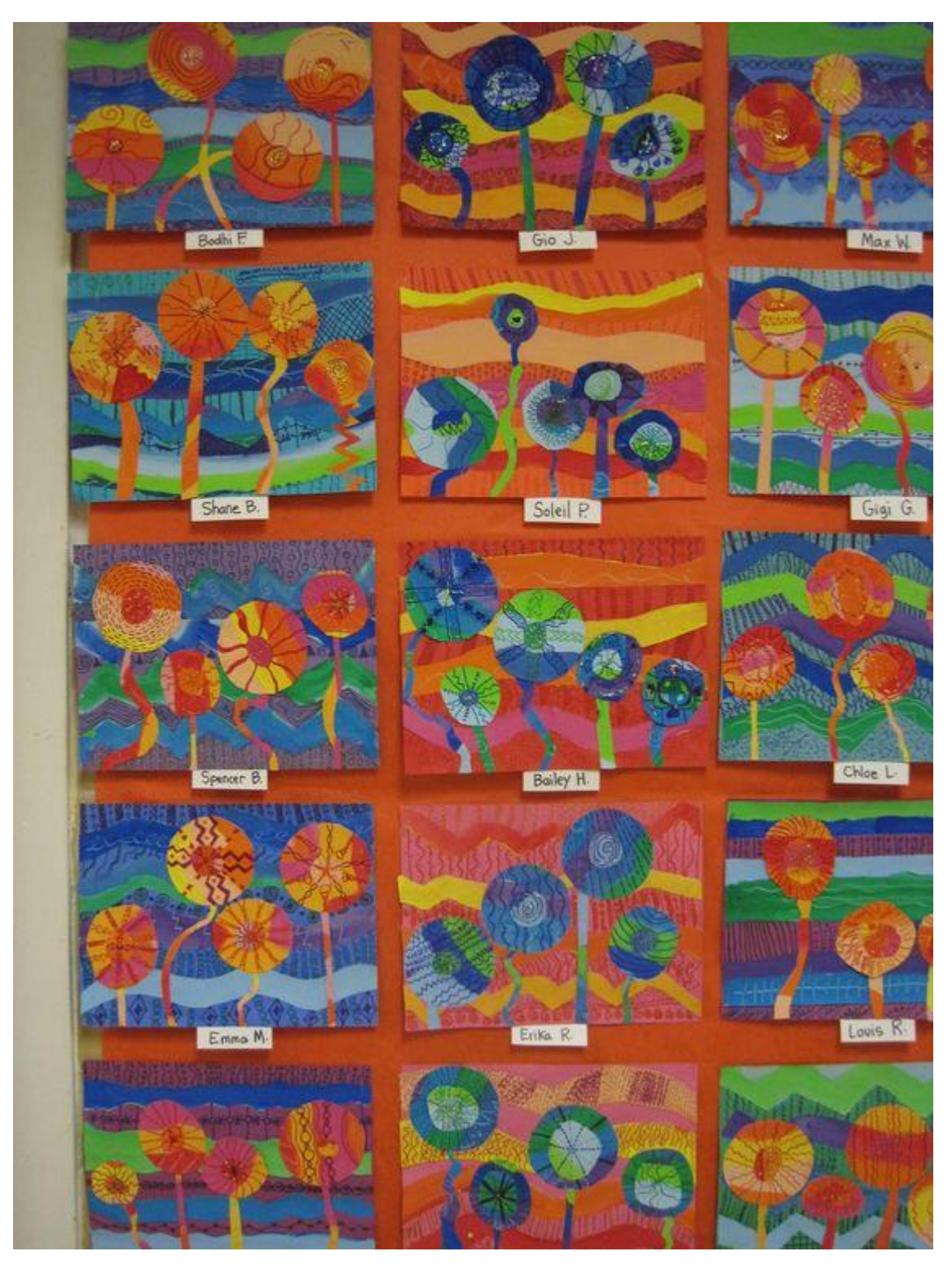
Layers of different shades of colour – tissue, paint, pens etc, overlayed with flowers of another set of colours.